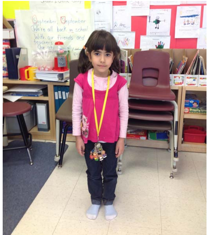
One of two winners in the student draw for a lanyard full of Monkeys

Parent volunteers prepare banana splits for all students at GSPS.